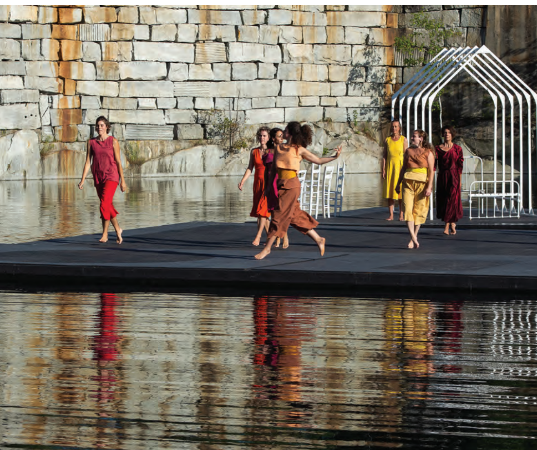
Cradle to Grave dancers at an abandoned granite quarry in Barre.