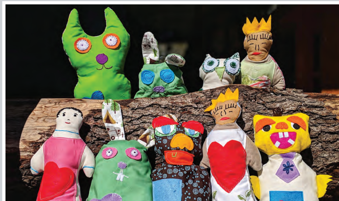
Hundreds of TLC dolls have been distributed across Vermont, including owls and a female figure crowned “the goddess.”