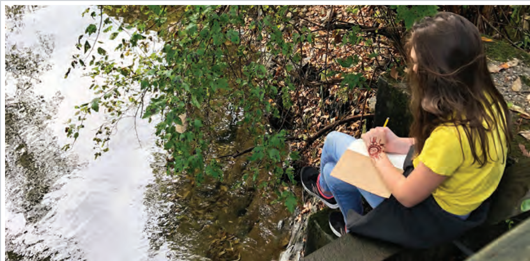
Students at Crossett Brook Middle School in Duxbury learn the techniques of scientific illustration and nature journaling.